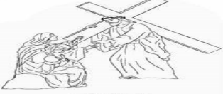
- Station VIII: Jesus meets the women of Jerusalem -