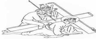
- Station III: Jesus falls the first time -