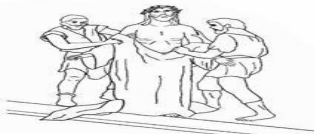
- Station X: Jesus is stripped of His garments -